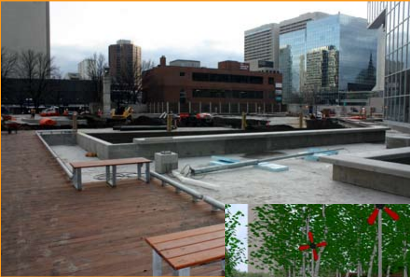
THE BOARDWALK FEATURE OF THE URBAN WETLAND IS IN PLACE. THE SQUARE WINDMILL BASE AND WINDMILL ARE BEING ASSEMBLED ON THE GROUND.